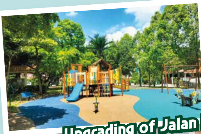
Upgrading of Jalan Pintau Park Playground