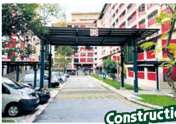
Construction of New Linkways