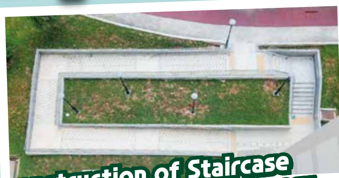
Reconstruction of Staircase with New Barrier-free Access Ramps at Blk 213