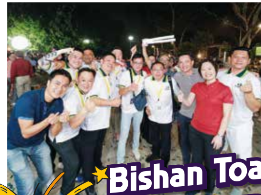
Bishan Toa-Payoh and Marymount Countdown 2024